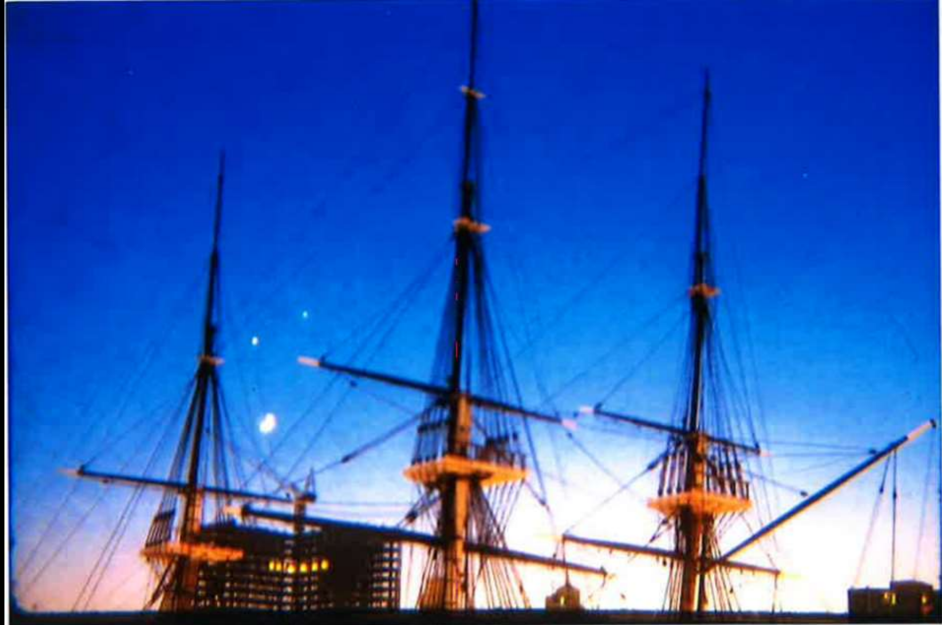
Moon, Venus and Jupiter over USS Constellation in Baltimore Harbor